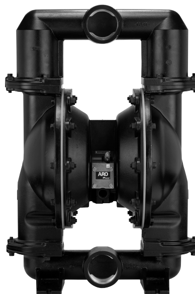
67389 Muffler Kit (not shown) included with pump