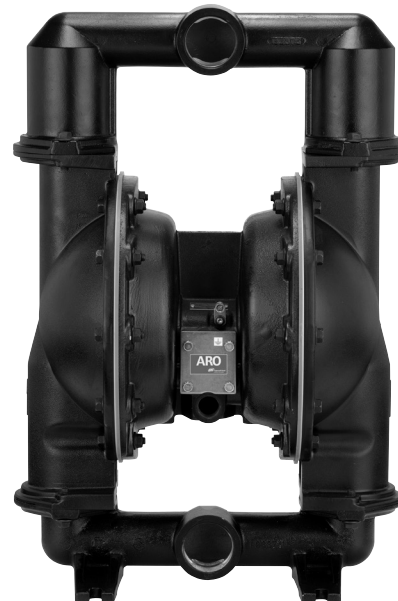
67389 Muffler Kit (not shown) included with pump